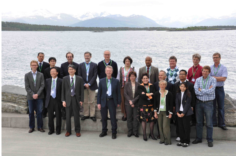
Figure 2. ISO 19152 Editorial Committee, Meeting in Molde, Norway, May 2009.

The standard has been developed by experts from all over the world: UN Habitat Land Tenure Section with its comprehensive knowledge on customary tenure systems, EU Joint Research Centre with a broad knowledge base on INSPIRE and LPIS, the United Nations School for Land Administration Studies and experts from Land Administration and Cadastral organisations, universities and normalisation institutes. See Figure 2.